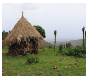
Ethiopia