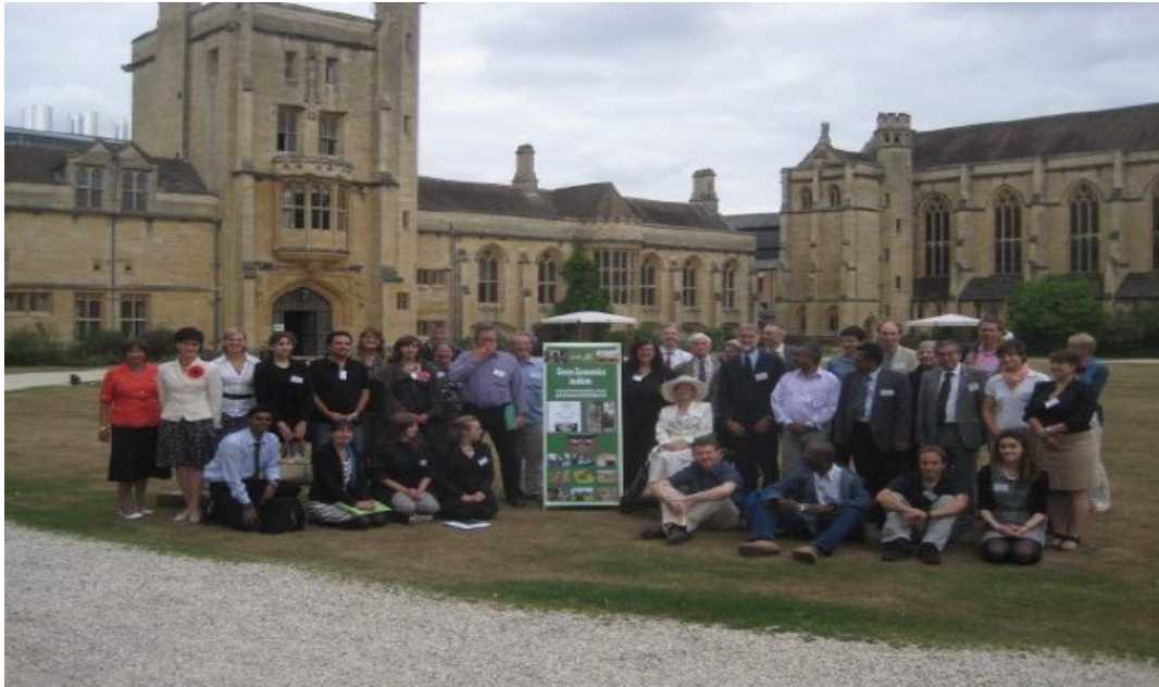
Photo: a lively session at our conference last year at Mansfield College, Oxford University

To include conference attendance and all dinners with Green Economist letters after name if successful M.GEI. Award ceremony with academic gowns, Must attend full conference. Must pre-register and pre – pay. Please send for further particulars £250. Open book examination will be run at Conference. Must be pre- booked for examination room to be provided.