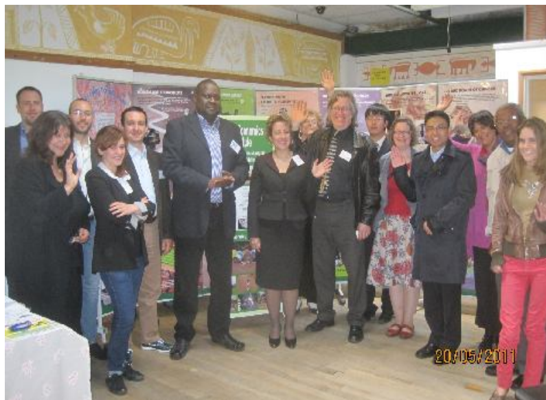
Photo: our symposium in May 2011, about women's equal pay and poverty in the Age of Austerity