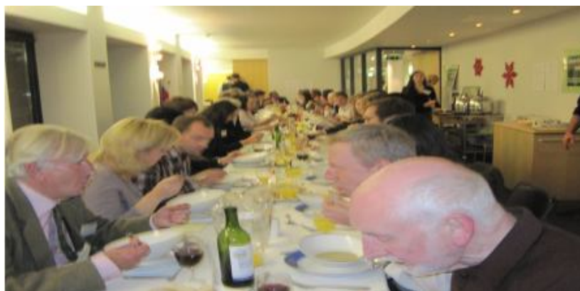
Photo: One of our lovely gala evening dinners. This one is at Oxford University for 90 people!

Organisations, large NGOS, companies, anyone requiring to receive an invoice or visa letter or to pay via an invoice (must be paid in advance of conference to accept the booking as we need to plan the spaces). Pre-booked and pre paid stall or exhibition stand only £500 for large organisations- (with turnover over £100,000), universities and companies, or £200 for smaller organisations and companies: with turnover under £100,000) or £150 for individuals (all rates + normal entry fee). Tiny campaigning organisations with income less than £100,000 -stall is £90.00 plus entrance fee