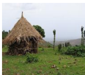
Ethiopia